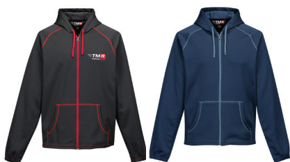
Carbon Fiber/Red Navy/Slate Blue