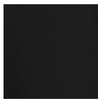
Black PMS NTR BLACK CPMS 7568 C