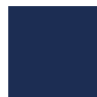
True Navy PMS 533 C