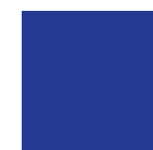
True Royal PMS 7687 C