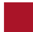
True Red PMS 200 C