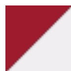
True Red/ White PMS 200 C