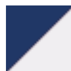
True Royal/ White PMS 768 C