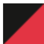
Black/ True Red PMS 426 C