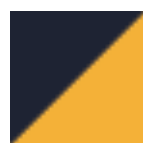
True Navy/ Gold PMS 533 C