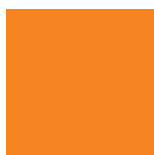
Safety Orange/ Black