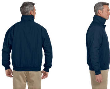
Featured Color: NAVY