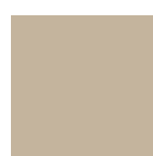
Khaki PMS 7504 C