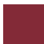
Red PMS 200 C