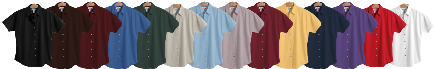
Black Brown Dark Maroon French Blue Forest Green Khaki Light Blue Light Gray Maroon Maize Navy Purple Red White