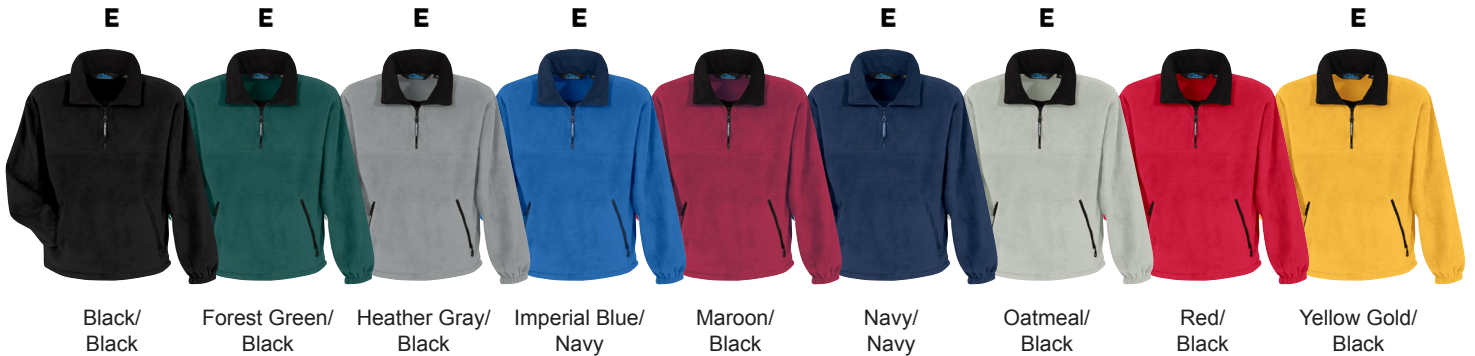
Black/Black Forest Green/Black Heather Gray/Black Imperial Blue/Navy Maroon/Black Navy/Navy Oatmeal/Black Red/Black Yellow Gold/Black